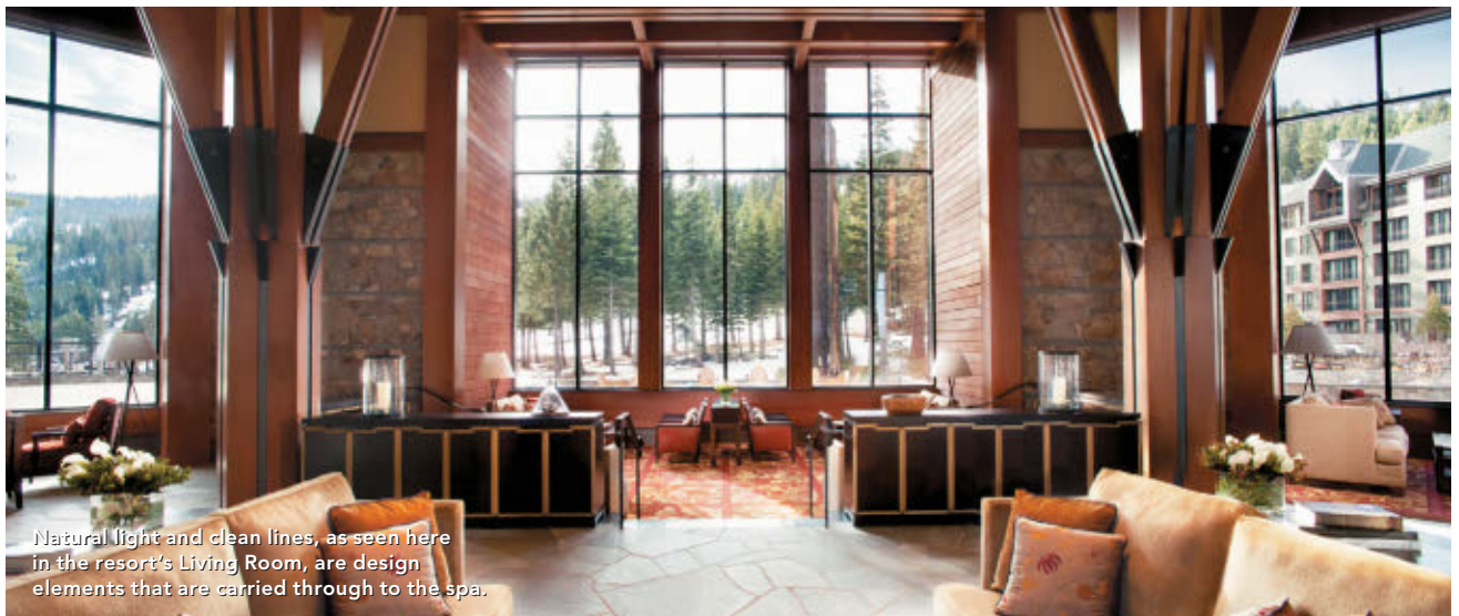
Natural light and clean lines, as seen here in the resort's Living Room, are design elements that are carried through to the spa.