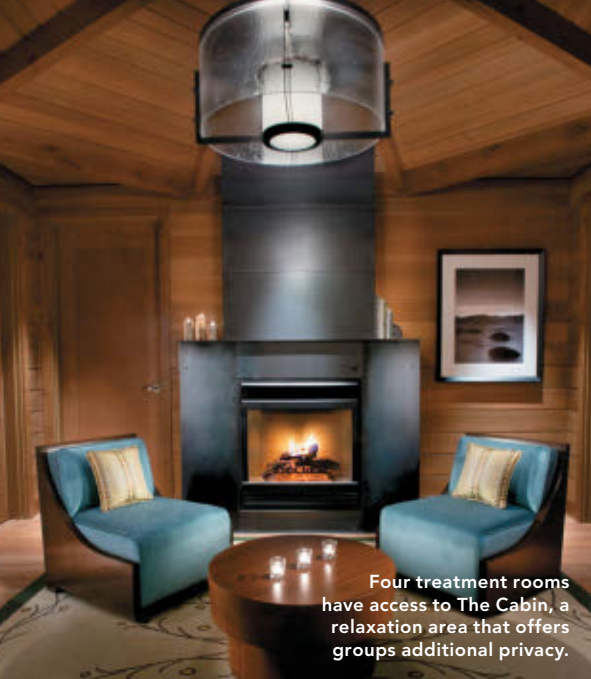
Four treatment rooms have access to The Cabin, a relaxation area that offers groups additional privacy.